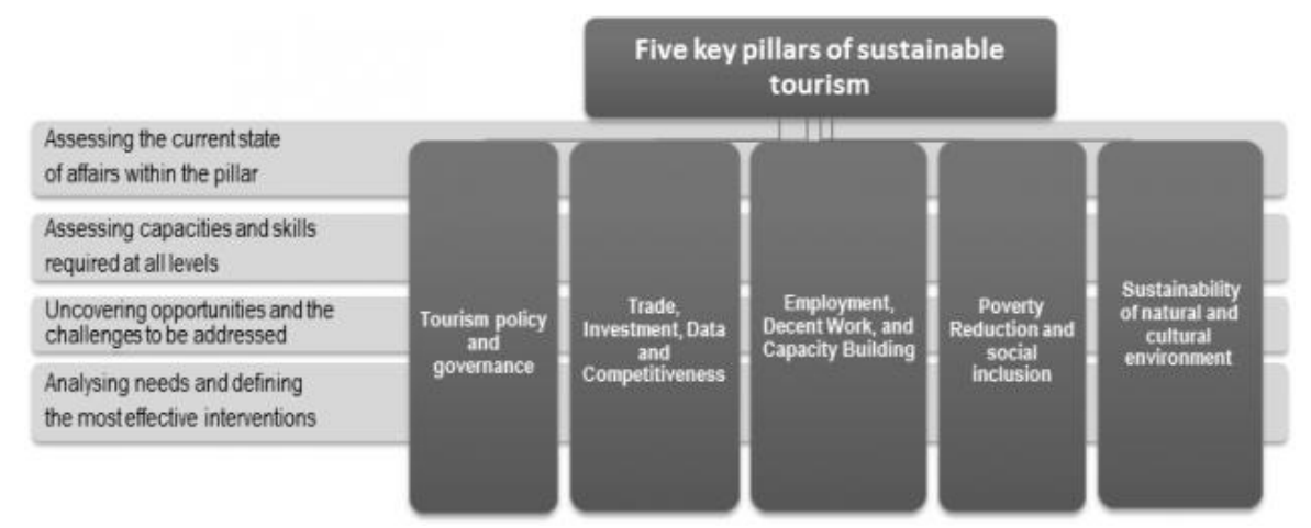
Figure: 1 Pillars of Sustainable Tourism

Community-based tourism has, for over three decades, been promoted as a means of development whereby the social, environmental and economic needs of local communities are met through the offering of a tourism product. The community will be aware of the commercial and social value placed on their natural and cultural heritage through tourism, and this will foster community based conservation of these resources. The residents earn income as land managers, entrepreneurs, service and produce providers, and employees. At least part of the tourist income is set aside for projects which provide benefits to the community as a whole.